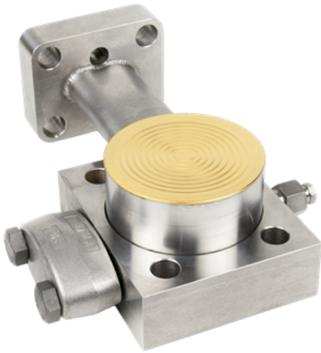
40 \mu\text{m} gold coating layer on PTH coplanar design.

The PTH can be supplied with various exotic diaphragm materials such as Hastelloy C276, Monel or Tantalum. The process flanges can also be supplied with similar exotic materials. Other materials are on request. The PTH is suitable for Gold Coating on the diaphragm. Available in 25 \mu\text{m} and 40 \mu\text{m} thickness. Gold Coating is often selected to protect the instrument against hydrogen permeation or for chemical resistance, or both.